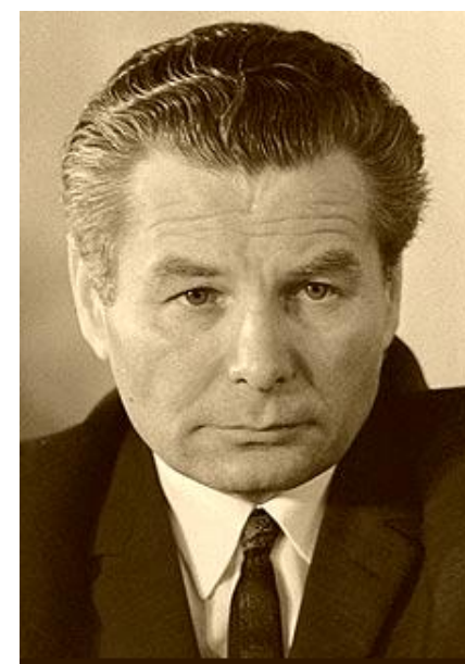
Ota Šik (1919–2004), a Czech economist and politician. He was one of the key figures in the Prague Spring. After the Velvet Revolution he became an economic advisor to the Czech president