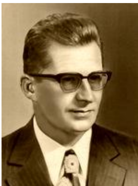
Lubomír Štrougal (born 1924), a former Czech politician and communist Czechoslovakia's prime minister (1970–1988)

This was said by a Minister of the Interior. The overall evaluation of the event is very demanding task which requires a complex review of external and internal factors.