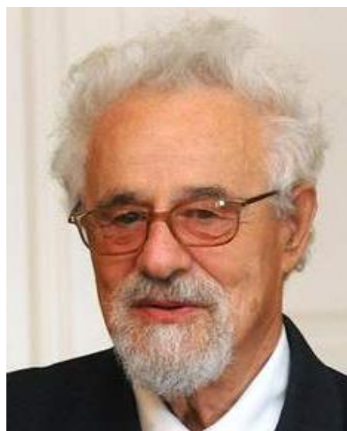
Valtr Komárek (1930–2013), a Czech economist, forecaster and politician. In 1968, he participated in the preparation of economic reforms of Prague Spring. In November 1989, he became the first deputy chairman of Government of National Unity Prime Minister