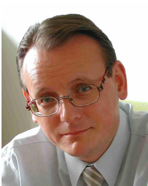
Pavol Janík (born 1956), a Slovak poet, dramatist and public figure, worked at the Ministry of Culture (1983–1987), was the editor of cultural section of the newspaper Pravda (1989–1990), Chairman of the Association of Slovak writers