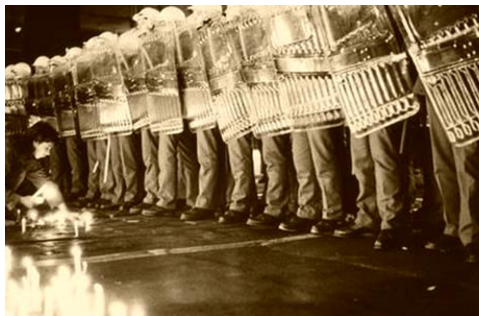
Stopping of the students' march walking along forbidden path by the public security forces on November 17 th , 1989, Prague